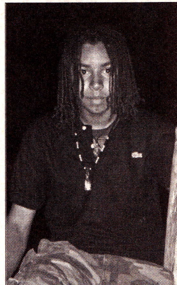
Octavia E. Butler.